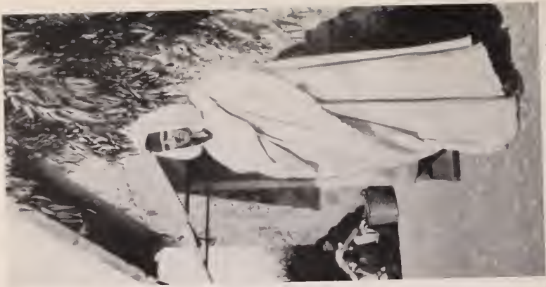
Photograph of the author wearing a Kabyle burnous